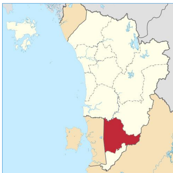
Fig. 1 Location of the sampling site in Kulim, Malaysia

Thirty (30) water samples were collected from 30 different locations within and around Kulim Hi Tech Park (KHTP) (Fig.1). The water samples included water tap, rivers, and ponds that have potential as drinking water. Table 1 shows the description of the collected water samples and their condition during the sampling.